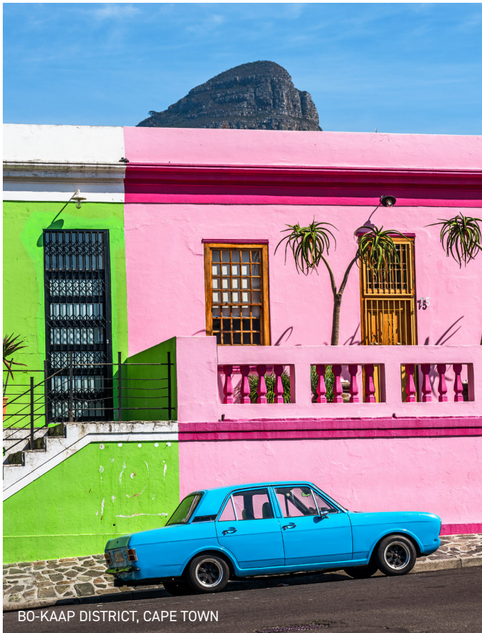
BO-KAAP DISTRICT, CAPE TOWN