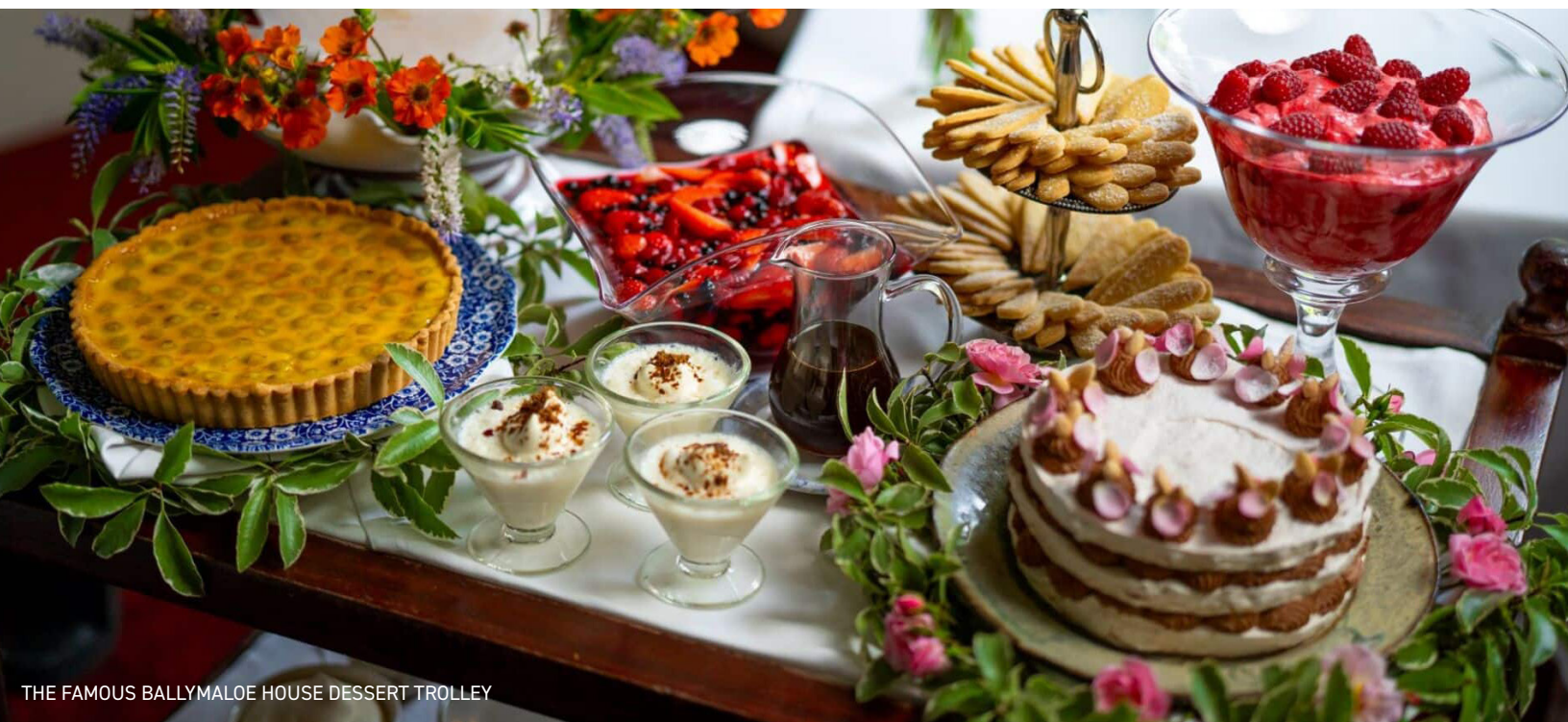
THE FAMOUS BALLYMALOE HOUSE DESSERT TROLLEY

Contact Onward Travel with questions or special requests: letsgo@onwardtravel.co 845-293-2729