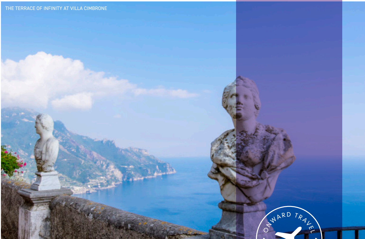
THE TERRACE OF INFINITY AT VILLA CIMBRONE