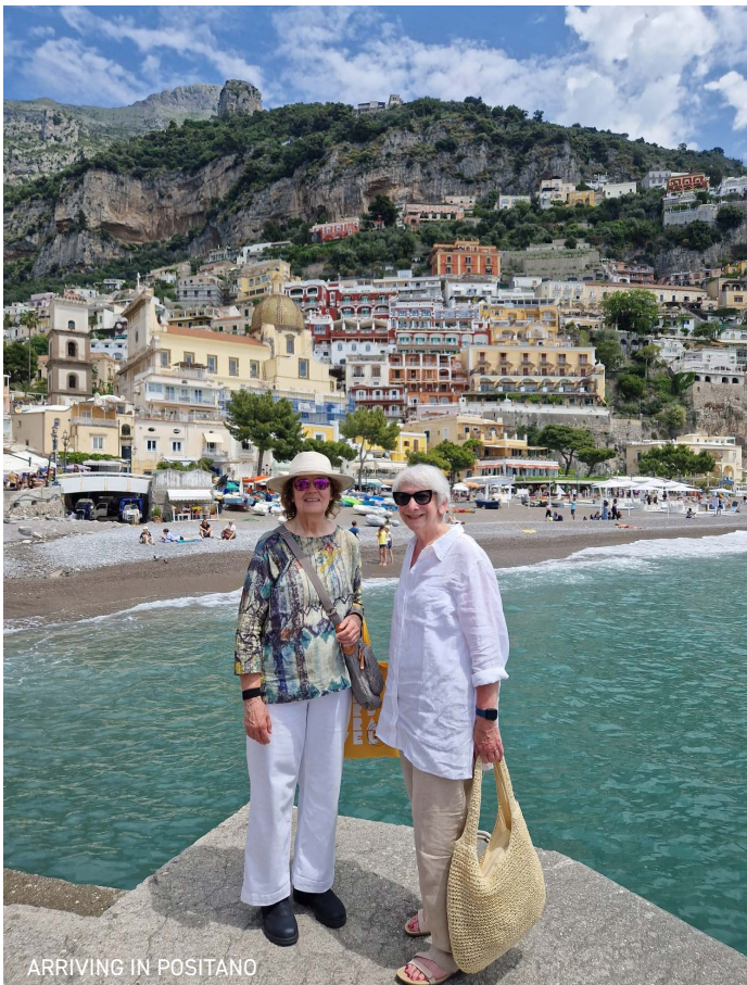
ARRIVING IN POSITANO