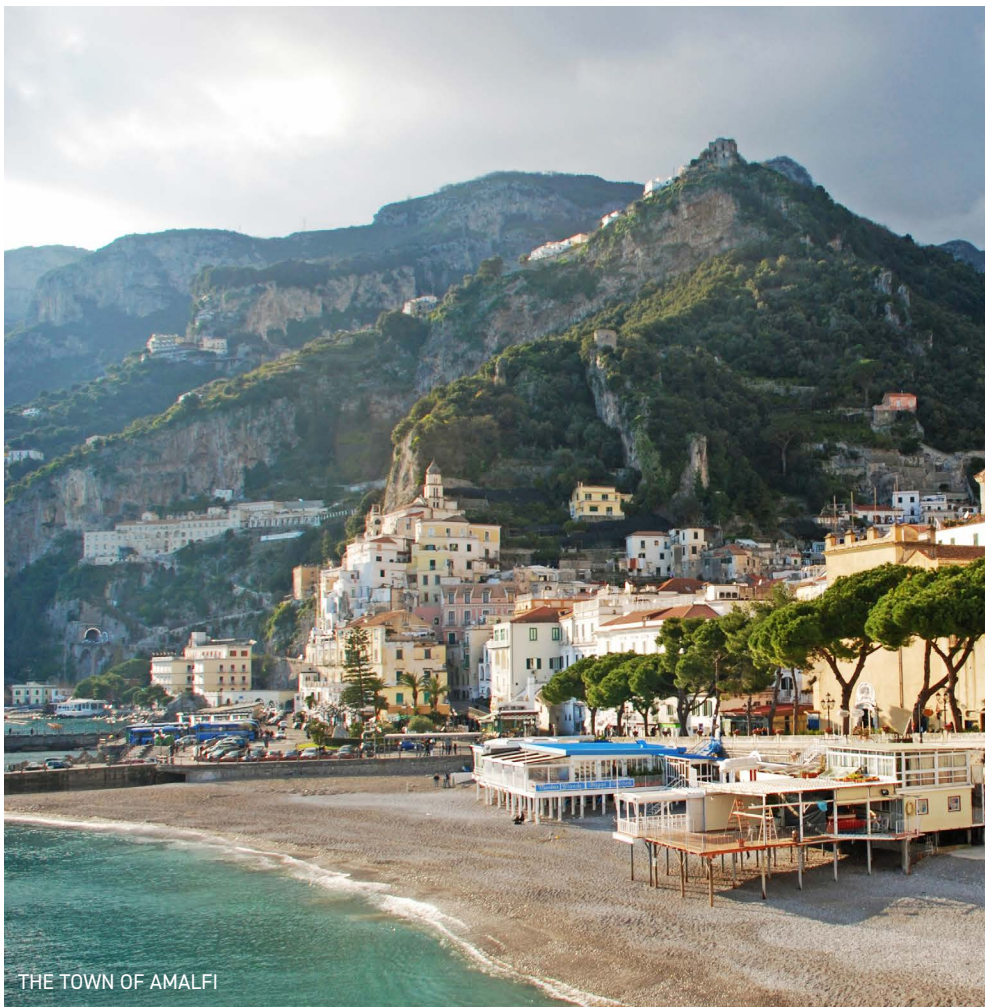
THE TOWN OF AMALFI

In the late spring, join Onward Travel to explore one of the most magical places there is... the absolutely enchanting Amalfi Coast in Italy's central Campania region.