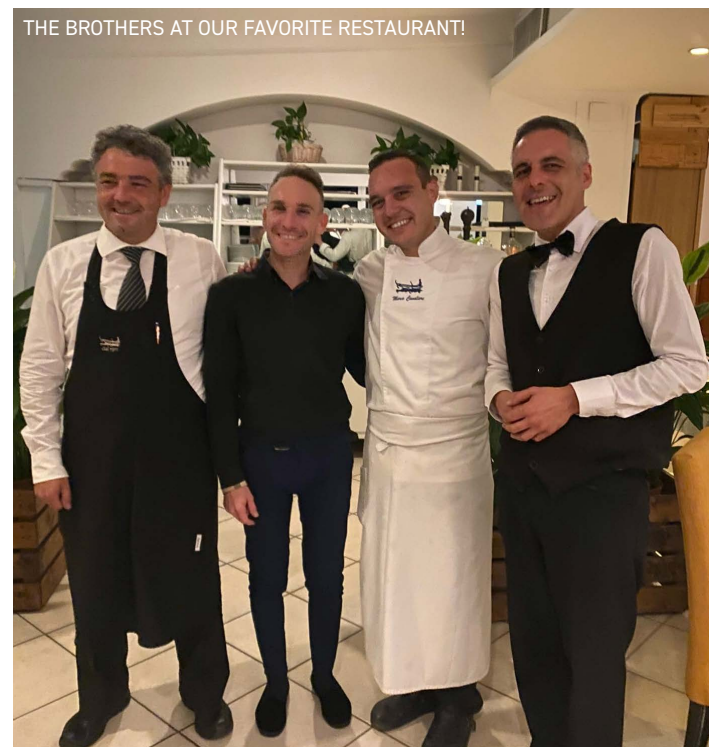
THE BROTHERS AT OUR FAVORITE RESTAURANT!