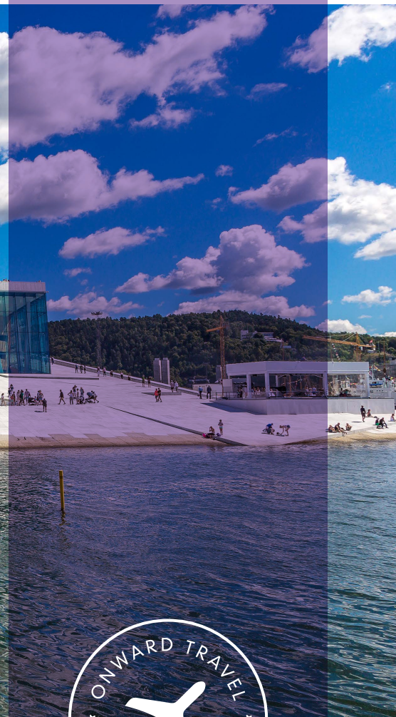
OSLO OPERA HOUSE