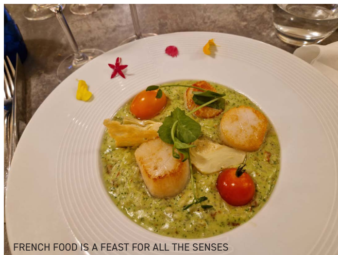
FRENCH FOOD IS A FEAST FOR ALL THE SENSES