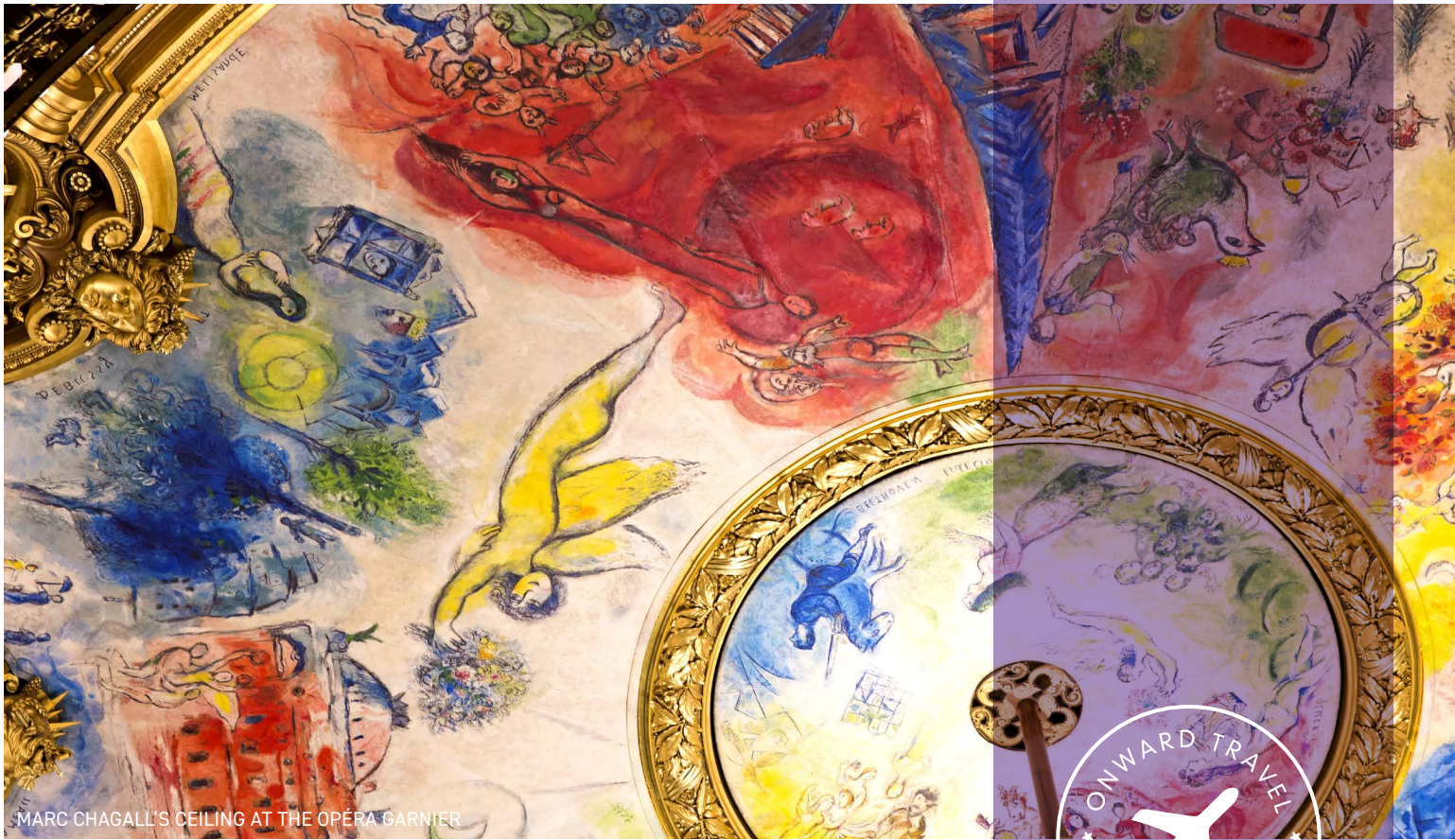
MARC CHAGALL'S CEILING AT THE OPÉRA GARNIER