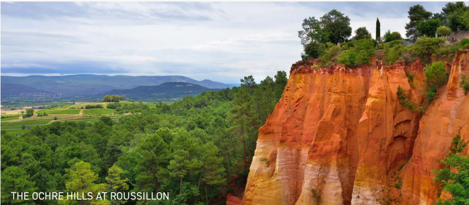
THE OCHRE HILLS AT ROUSSILLON