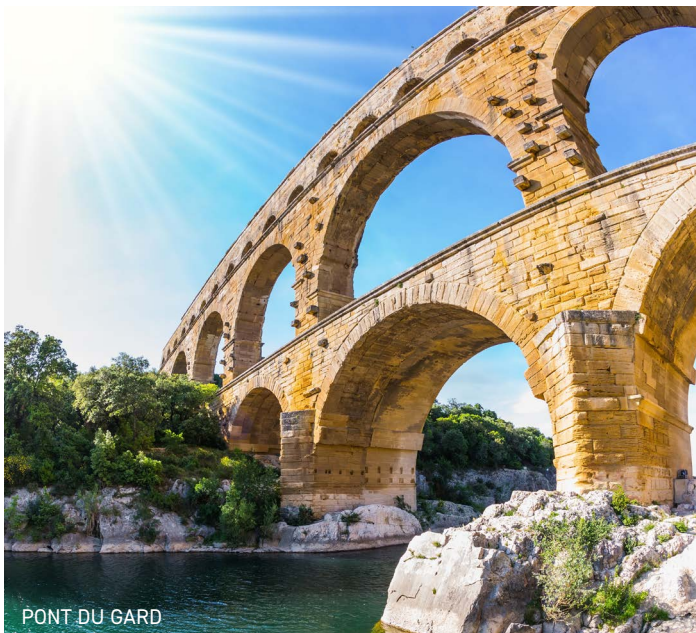
PONT DU GARD