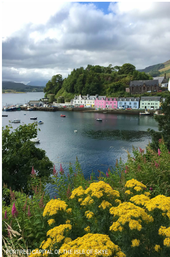
PORTREE! CAPITAL OF THE ISLE OF SKYE

Please note, drinks are not included with dinner at Kinloch Lodge