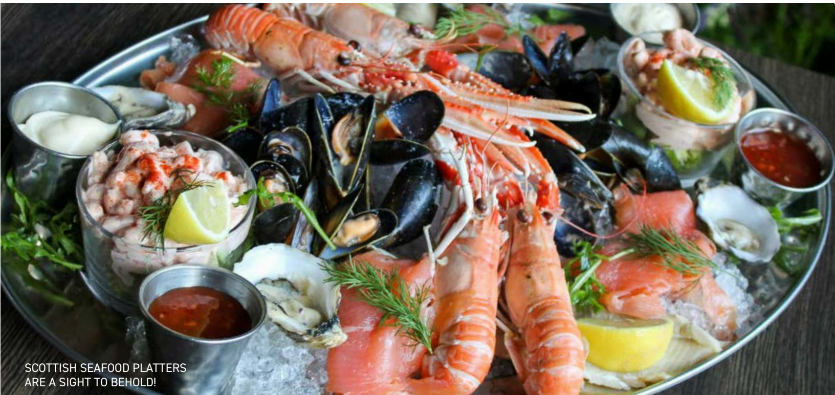
SCOTTISH SEAFOOD PLATTERS ARE A SIGHT TO BEHOLD!

Contact Onward Travel with questions or special requests: letsgo@onwardtravel.co 845-293-2729