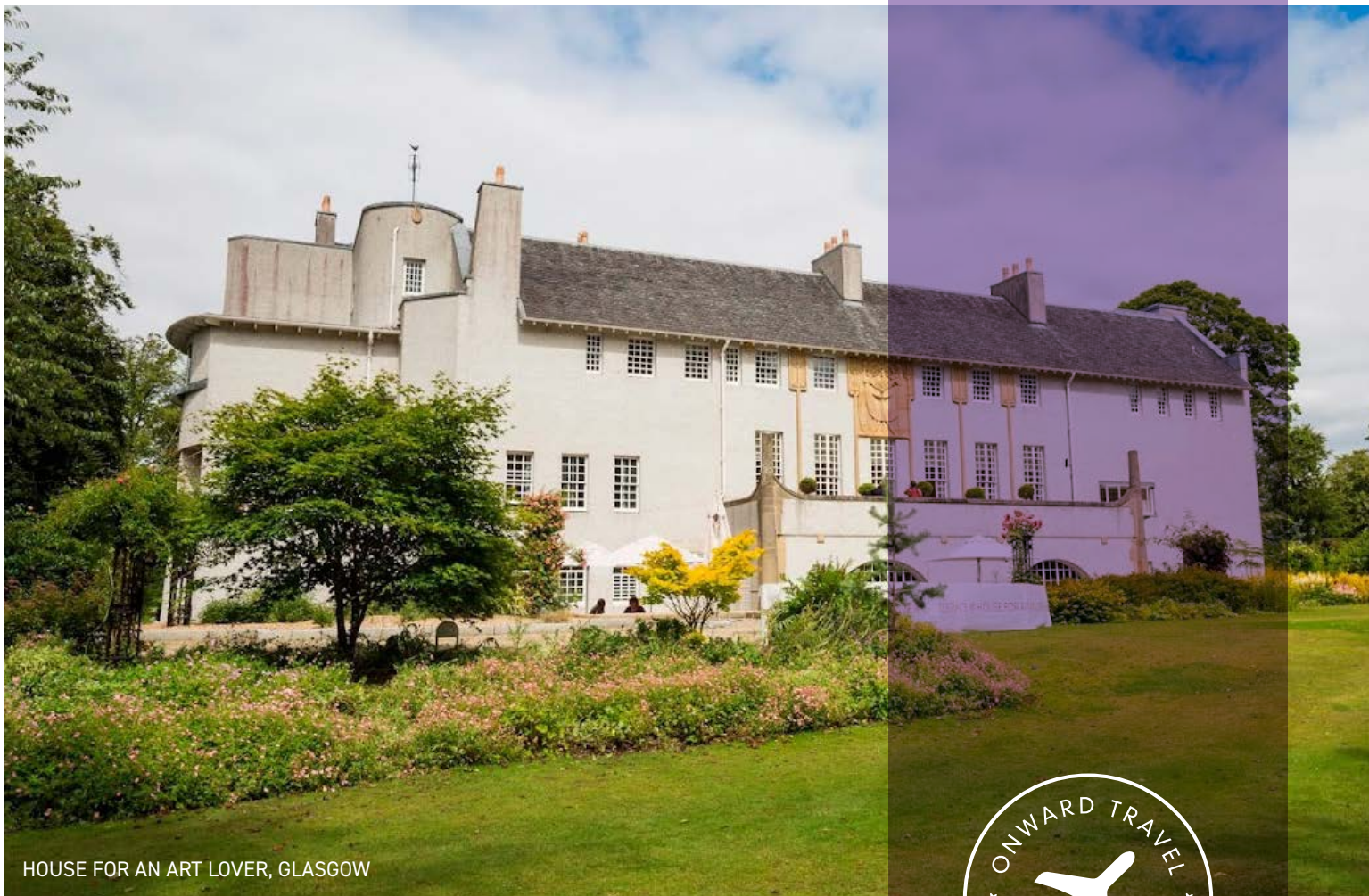
HOUSE FOR AN ART LOVER, GLASGOW

The Wild Beauty of Scotland just might be the adventure you've been waiting for. Pack light and get ready to traverse this gorgeous country: from the artistic city of Glasgow to the rugged Highland islands, Scotland will at many times surprise you and at others be exactly as you'd dreamed it would be.