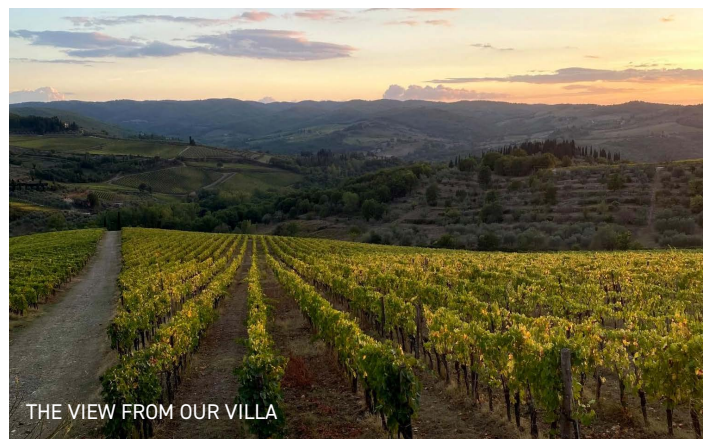
THE VIEW FROM OUR VILLA