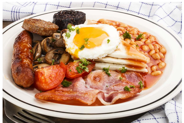
THE FULL IRISH!