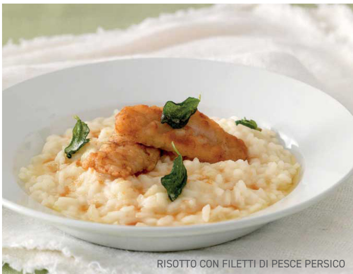
RISOTTO CON FILETTI DI PESCE PERSICO