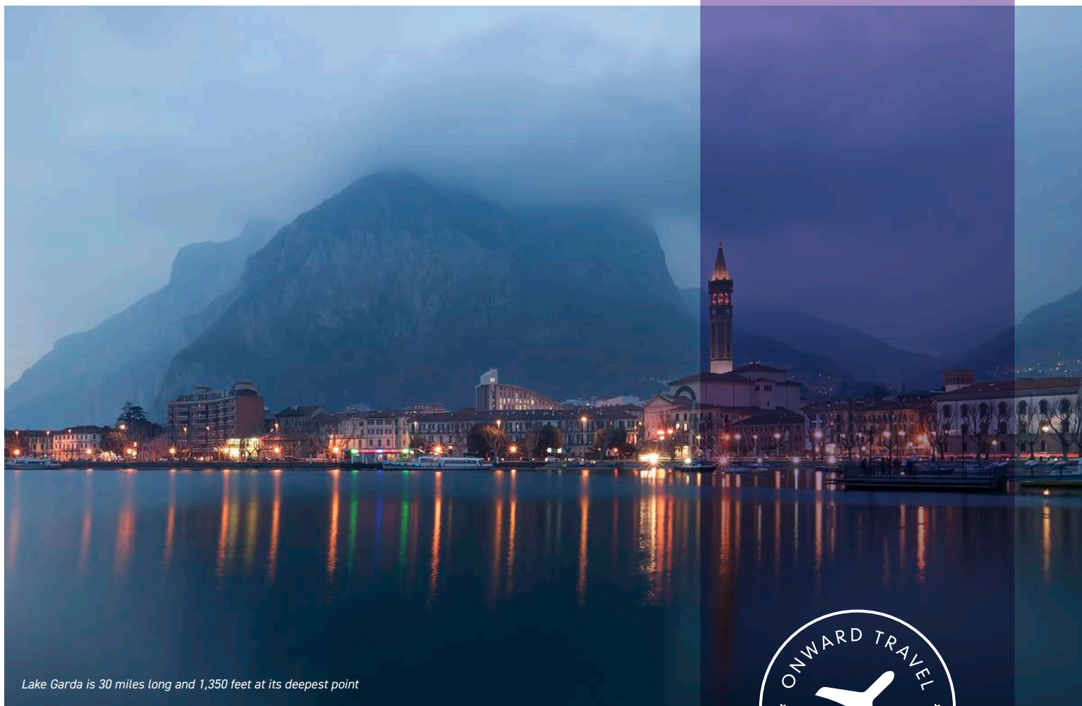
Lake Garda is 30 miles long and 1,350 feet at its deepest point