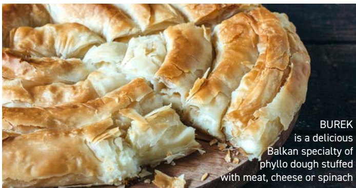
BUREK is a delicious Balkan specialty of phyllo dough stuffed with meat, cheese or spinach