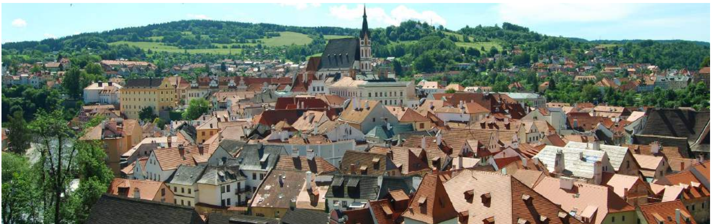
Looking out from its castle at the UNESCO World Heritage village of Český Krumlov