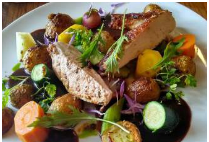
The farm-to-table food at Goldie is as beautiful as it is delicious