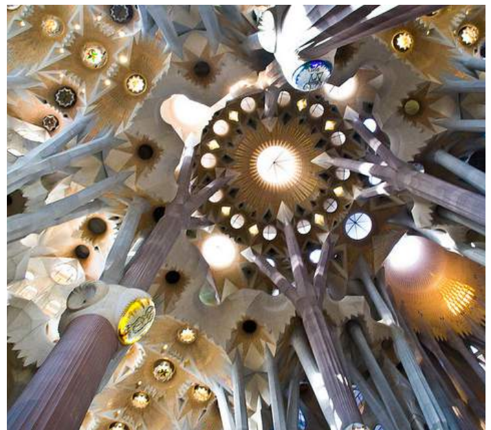
Gaudi's La Sagrada Família is an absolutely unforgettable manifestation of the boundlessness of human creativity.