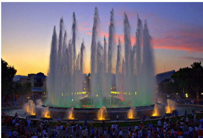
The enchanting Magic Fountain lights up the Barcelona evening.