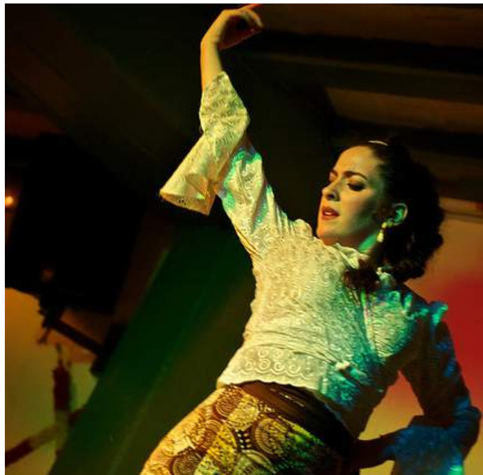
Flamenco in Southern Spain is an important part of local folk culture, with its origins dating back to the 18th century.