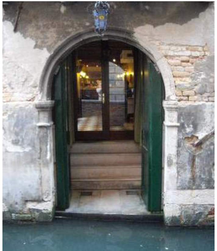
The water door entrance where we'll arrive at Hotel Al Ponte Mocenigo.