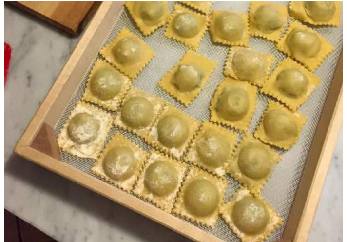
Homemade Tuscan ravioli, it's the stuff dreams are made of...